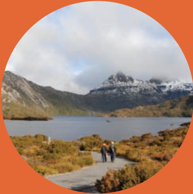
Canberra and Snow Experience June 2024

We are excited to present our short stay holidays for 2024. We can provide a quote for you to submit at your NDIS plan review.