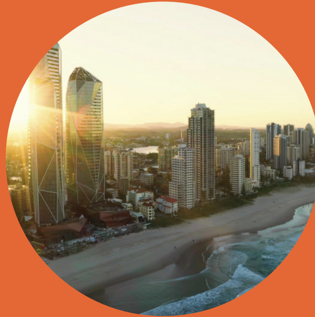
Gold Coast Experience October 2024